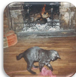
M'pache, 1 st cat!