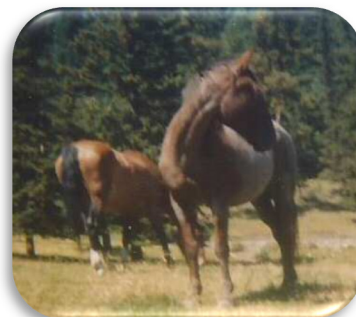
Dusty and Belle